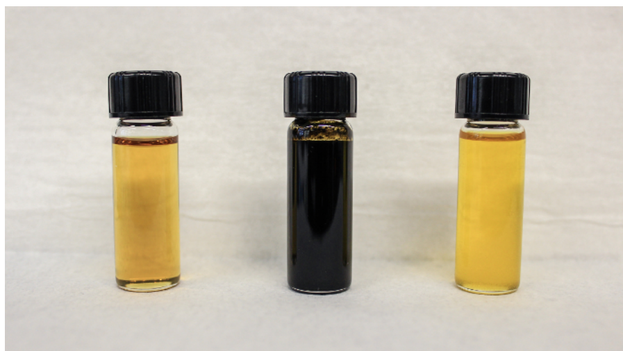
Figure 3. Comparison of Isochrysis and soybean biodiesel fuels. Green Isochrysis biodiesel (middle) is produced by esterification of extracted and purified free fatty acids. Decolorization produces a product (right) with similar properties to commercial biodiesel (left). Please click here to view a larger version of this figure.

Esterification of the FFAs with H 2 SO 4 and methanol then produced fatty acid methyl esters (FAMES, i.e. , biodiesel) as a dark green near black oily liquid in greater than 90% yield ( Figure 3 ). Decolorization by heating over Montmorillonite K10 29 (MK10) clay then gave a yellow/orange product, similar in appearance to other commercial biodiesel fuels (see List of Materials) ( Figure 3 ). Results from the FAME analysis of decolorized Isochrysis biodiesel fuels are shown in Table 2 .