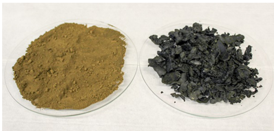
Figure 2. Comparison of commercial Isochrysis . Isochrysis paste (80% wet) is spread along the bottom of a crystallizing dish and left to air-dry at room temperature for 48-96 hr before processing. The resulting dried Isochrysis is obtained as a dark-colored flaky material (right) that is different in appearance than the commercial dry powder Isochrysis (left). Please click here to view a larger version of this figure.

Prior to processing, the Isochrysis paste ( Iso -paste) was first dried. This was conveniently accomplished on larger scale by adding the Iso -paste to a large crystallizing dish and allowing the material to air-dry at room temperature. During drying, some pooled water forms (generally reddish colored) that can be removed by decanting or pipetting to accelerate the drying process. After approximately 48 - 96 hr, the now dry Isochrysis could be scraped out of the crystallizing dish and obtained as a black/green flaky material with a seaweed-like smell ( Figure 2 ). Yields of dry biomass were generally 20% w/w of the paste as advertised. By contrast, the powdered Isochrysis product ( Iso -powder) was a yellow-brown, finely milled, dry powder (95% dry) that was used directly without further processing ( Figure 2 ).