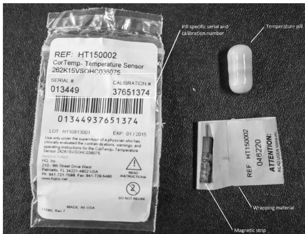
Figure 2. Ingestible telemetric temperature pill. Ingestible telemetric temperature pill and packing material. On the left the wrapping material is visible, which contains the temperature pill individual serial and calibration number. On the right, the temperature pill and the magnetic stripe are shown. In this case the temperature pill is not in contact with the magnetic stripe, which means that the battery is activated. Please click here to view a larger version of this figure.