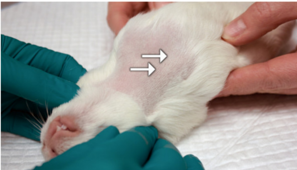
Figure 3. Position of the guinea pig for jugular vein blood sampling. This illustrates the position of the guinea pig and the puncture site for jugular vein blood sampling. The arrows indicate the course of the jugular vein with the uppermost arrow pointing towards the recommended puncture site.