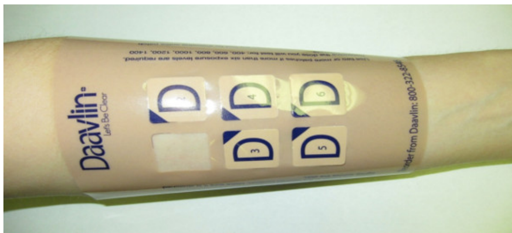
Figure 2. The Daavlin patch on a forearm with one sticker removed for UV exposure. The subsequent five stickers would then be removed at varying time-points to expose the skin to varying durations of UV.