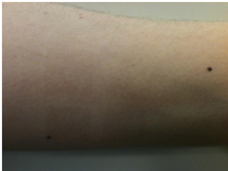
Figure 3. Visible UV exposure on a forearm. Six squares of skin were exposed to UV in between the two black dots using the Daavlin patch. On the left side of the image are the areas that were exposed the longest ( i.e. the lower left square #1 for 20 min and the upper left square #2 for 18 min). Squares #1 and 2 appear somewhat red, whereas the remainder do not, indicating that the MED is 18 min (square #2).