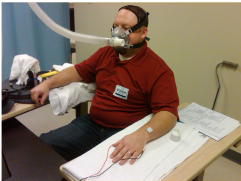
Figure 5. A patient during BreESTim. Surface electrodes are placed on Neiguan and Waiguan.