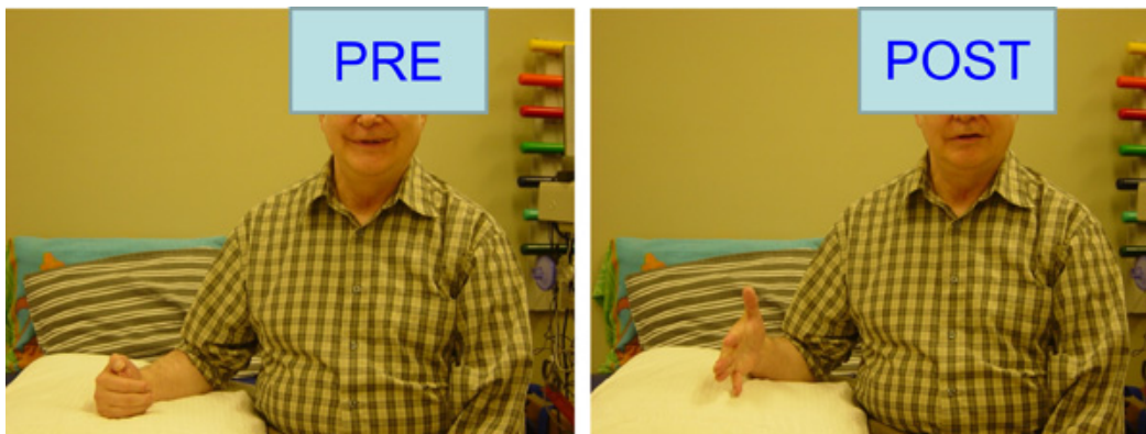
Figure 1. Comparison of hand posture pre- and post-BreESTim. The stroke patient could open his hand after BreESTim.

Voluntary breathing plays a key role in BreESTim. It is important to choose a facemask that fits the patient ( Figure 5 ) to prevent air leakage. The airflow rate is relatively low during normal breathing (1.6 liter/sec, Figure 6 ). Forceful voluntary inhalation could greatly increase the airflow rate (about 8 liter/sec). Placement of surface electrodes is also important. As described in detail and shown in Figure 3 and Figure 4 , placement for pain and spasticity management is different. It is necessary to note that location of muscle belly of finger extensors may change as a result of atrophy, deformity after stroke.