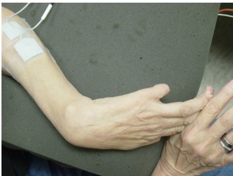
Figure 4. Placement of surface electrodes on finger extensors.