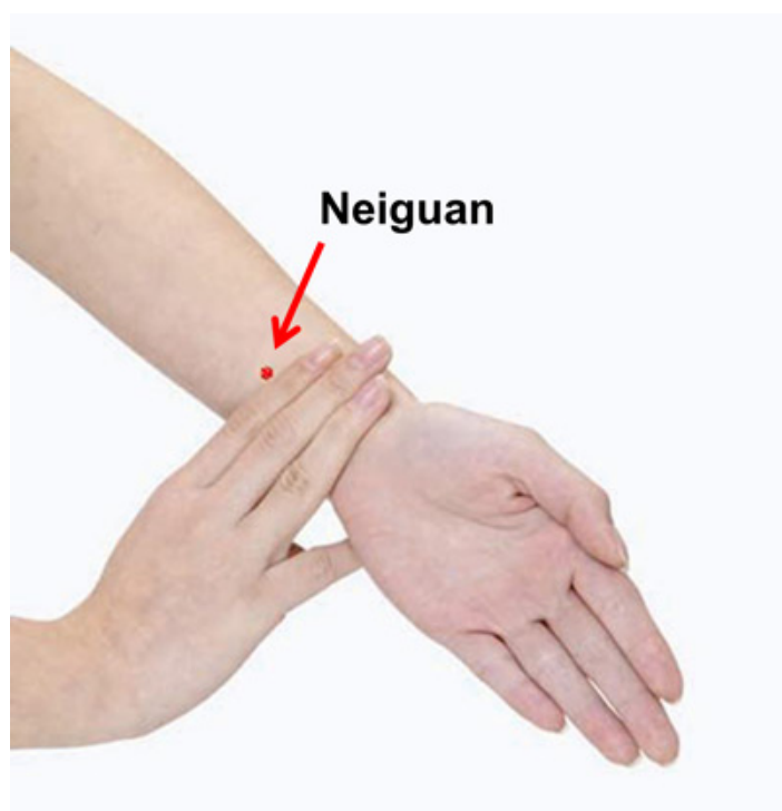
Figure 3. Location of Neiguan. Note, Waiguan is the counterpart of Neiguan on the dorsal aspect of the forearm.