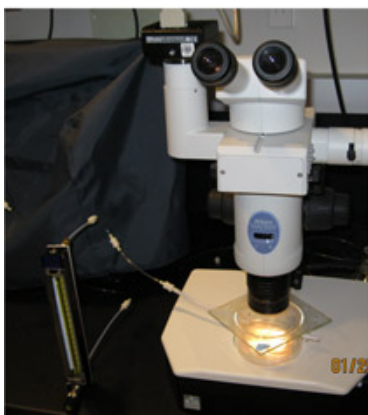
Figure 3. Visualization of C. elegans in hypoxia with microscopy. Worms are exposed to hypoxia using the methods outlined. The transparent environmental chamber (constructed with a pyrex crystallization dish and glass plate) is placed directly on the stage of a dissecting scope. Two views are shown, one including the entire gas flow set up, the other with just the chamber on the microscope stage.