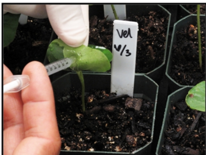
Figure 3. Hand infiltration of Agrobacterial mixture into the cotyledons of cotton through the wounding sites using a needleless syringe