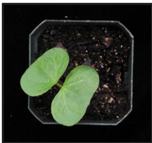
Figure 1. A cotton seedling at about two-week old stage with two fully expanded cotyledons used for Agrobacterial infiltration.

Approximately two weeks after hand-infiltration with Agrobacterial mixture, the albino phenotype caused by GrCLA1 silencing was clearly observed on the true leaves. The silencing efficiency reaches almost 100% in multiple experiments with more than 50 plants. The silenced plants display a uniformly distributed and very strong albino phenotype on newly developing leaves with a mosaic on the elder leaves (Figure 4).