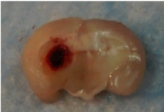
Figure 1. Coronal section of mouse brain 15 minutes after ICH surgery. Immediately after sacrifice the brain was inspected for ICH success based on gross inspection of a coronal section at the needle insertion site. Hemorrhages that tracked down to the base of the brain, up the needle track past the corpus callosum, or into the ventricles were deemed unsuccessful and that mouse was eliminated from all analyses. Overall ICH success rates were 75-85% in 50 mice with 0% mortality.