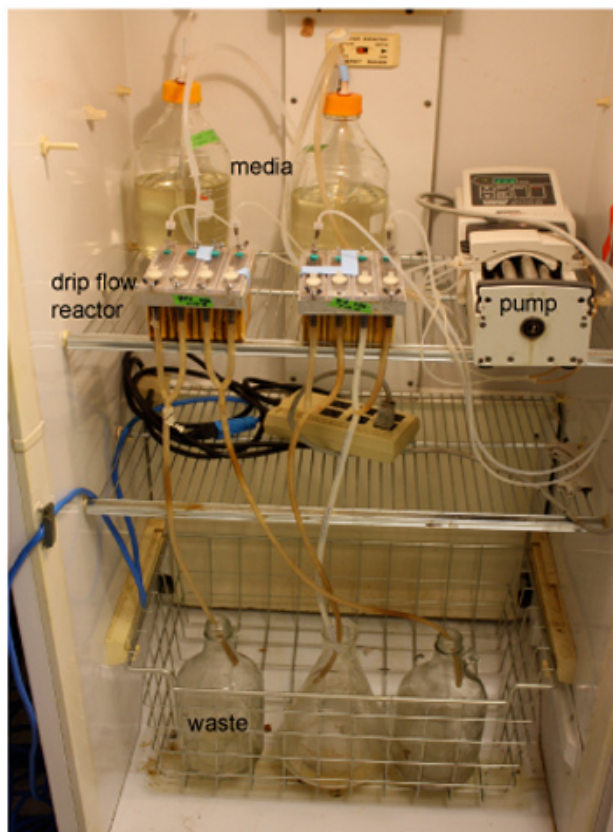
Figure 1. The drip flow reactor setup. Important components are labeled.