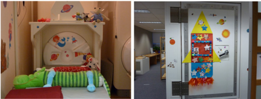
Figure 1. The MSR and MEG helmet have been decorated with stickers and soft toys.

A representative study in our laboratory used this protocol to study the development of logic in child language. Twenty-six children aged 3-4 years (mean age 4 years and 5 months) participated in at least one acquisition session. Seventeen of those children returned for a second testing session and five came for a third testing session. Average head movement was less than 3.7 mm (s.d. 3.1 mm), well within the 5mm threshold. Movements greater than 5mm occurred in 4.5% of the sessions, with variation ranging from 5.5 mm to 15 mm (Mean= 8.6mm, s.d.= 2.5 mm).