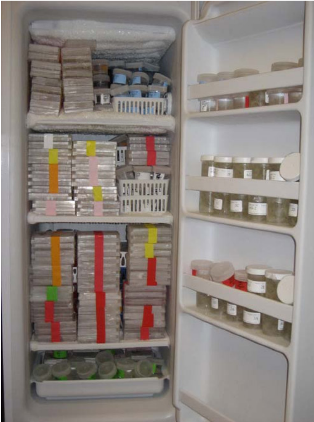
Figure 2. Our vermet brain bank now consists of close to 20,000 systematic sections from over 30 monkeys.