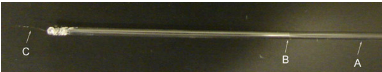
Fig. 1 Low magnification image of a sharpened needle used for lens transplantation. A glass capillary (B) is inserted into the Pasteur pipette (A), and a thin tungsten wire (C) is inserted into the open end of the capillary. The glass over the wire is softened with a Bunsen burner. Using forceps, hold steady the glass end with the metal wire while twisting the other end of the Pasteur pipette with your hand. The softened glass should spiral around the metal, gripping it in place.