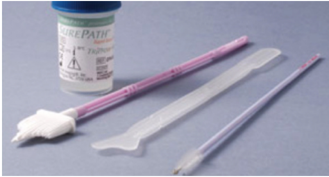
Figure 2. Pap smear tools. Shown in sequence are: a liquid cytology canister, cervical broom, spatula, and endocervical brush.