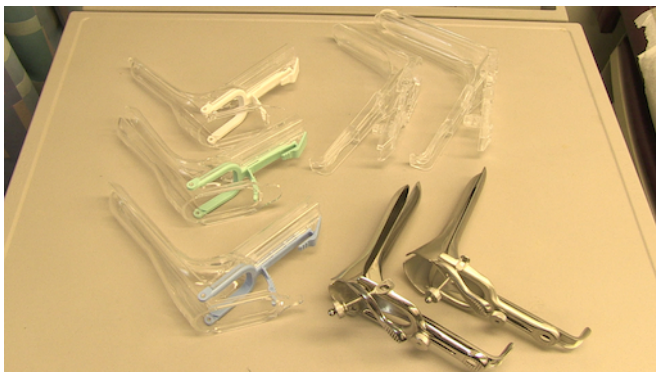
Figure 1. A photograph of commercially available speculums in different sizes.

There are two types of speculums: metal and plastic ( Figure 1 ). This demonstration utilizes plastic, as plastic speculums are most commonly used in clinics for routine testing. When using a metal speculum, it's recommended to use a Graves speculum if the patient has given birth vaginally, and a Pederson speculum if the patient has not. Pederson and Graves speculums are different shapes, and both come in many different sizes (medium is used most often). Prior to placing a metal speculum, it is helpful to perform a digital cervical exam to assess for the appropriate speculum size. The depth and direction of the cervix is estimated by placing one finger into the vagina. If the patient's cervix can be located while the patient is seated, it is likely that the patient has a shallow vagina, and therefore should be most comfortable with a short metal speculum.