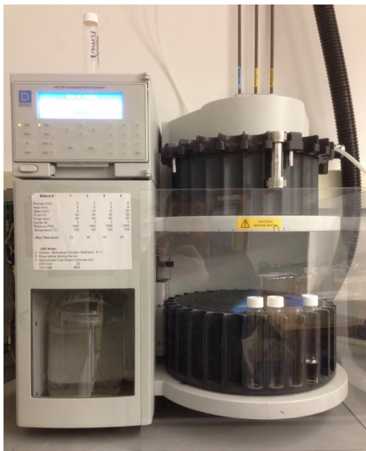
Figure 2. An Accelerated Solvent Extractor (ASE).