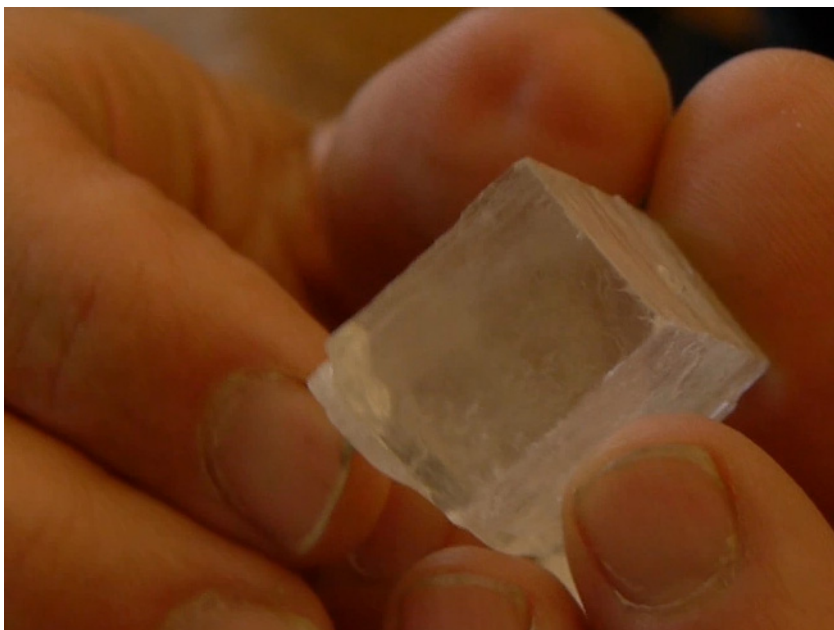
Figure 3. Halite displaying cubic crystal form.