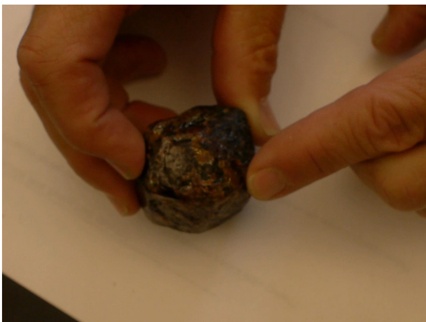
Figure 4. Garnet displaying dodecahedron form.