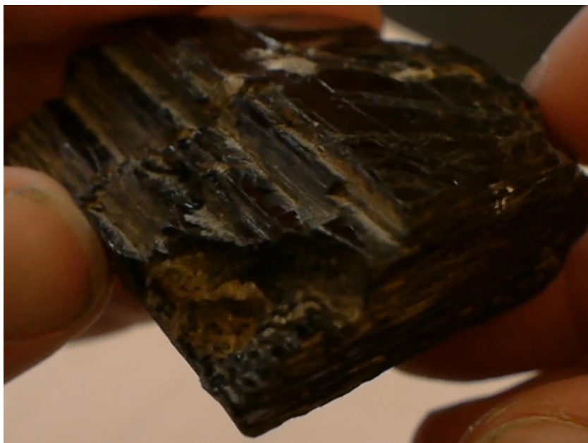
Figure 5. Biotite displaying pseudo-hexagonal form.