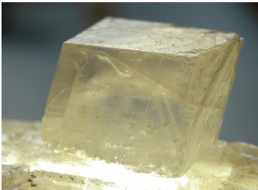
Figure 7. Calcite displaying rhombohedral cleavage. Symmetric breaking and fracture surfaces are generated by zones of relative weakness in atomic bonding within the crystal lattice. Calcite cleavage results in the specific polyhedron known as rhombohedron.