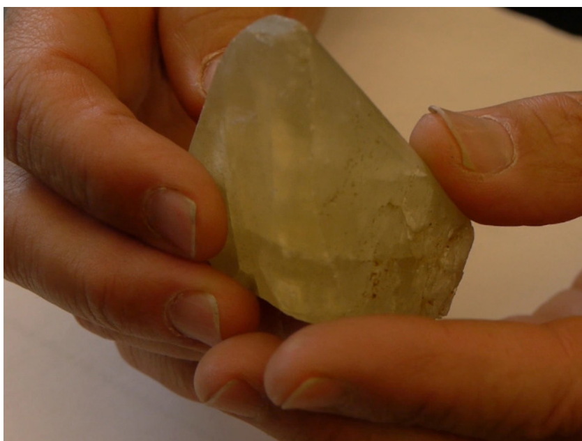
Figure 2. Calcite displaying scalenohedron form. Note how several crystal faces intersect to form crystal edges and the combination of edges forms points known as "vertices." Symmetric crystal growth forms are generated by repetition of fundamental atomic structures (unit cells) within the crystal lattice. In this case, calcite crystal growth generates the specific polyhedron known as a scalenohedron.