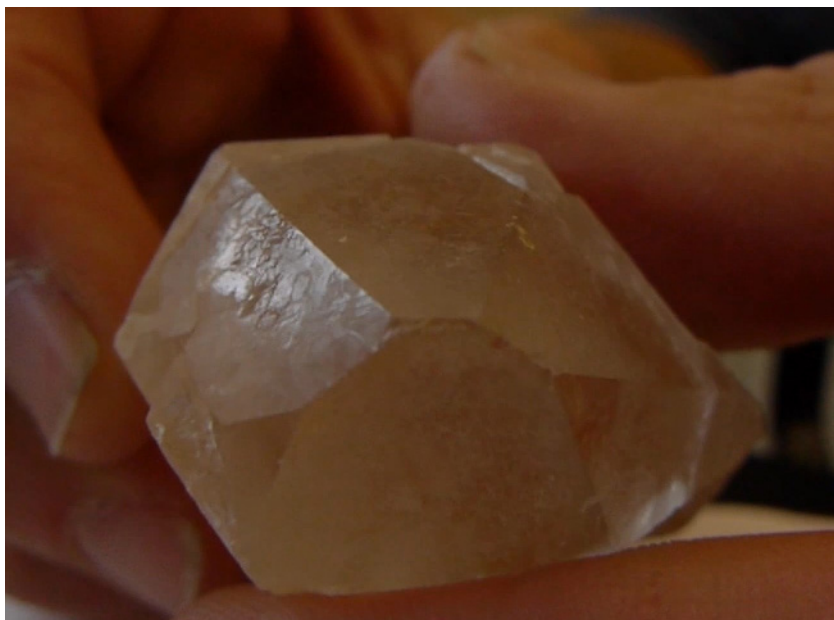
Figure 1. Quartz displaying hexagonal dipyramidal form.