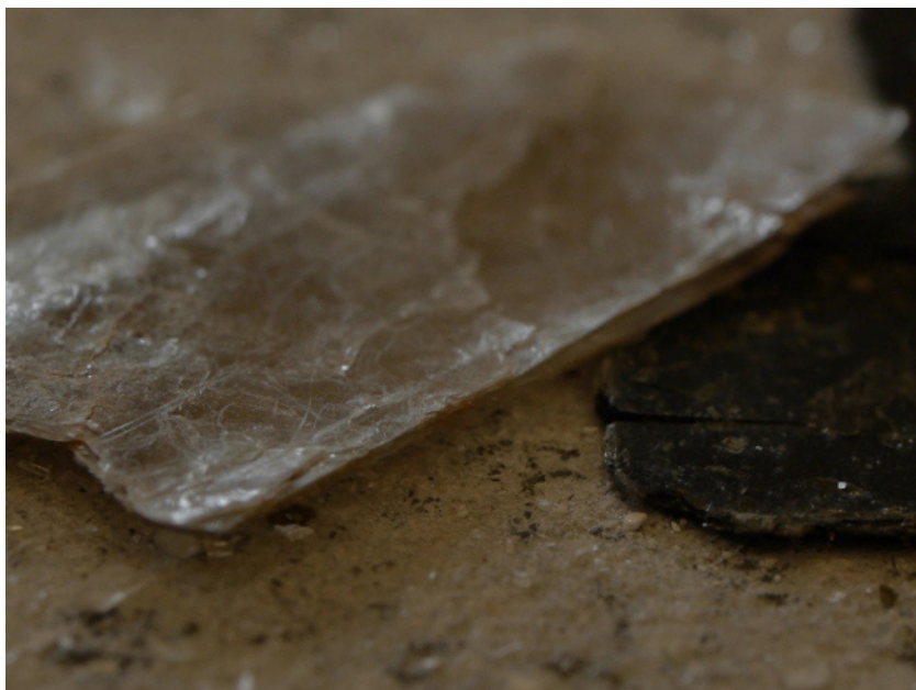
Figure 9. Biotite displaying planar cleavage.