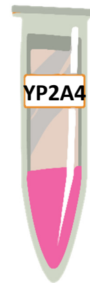
Tubes with GITC solution