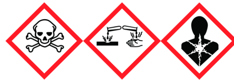
Safety Data Sheet for Trizol