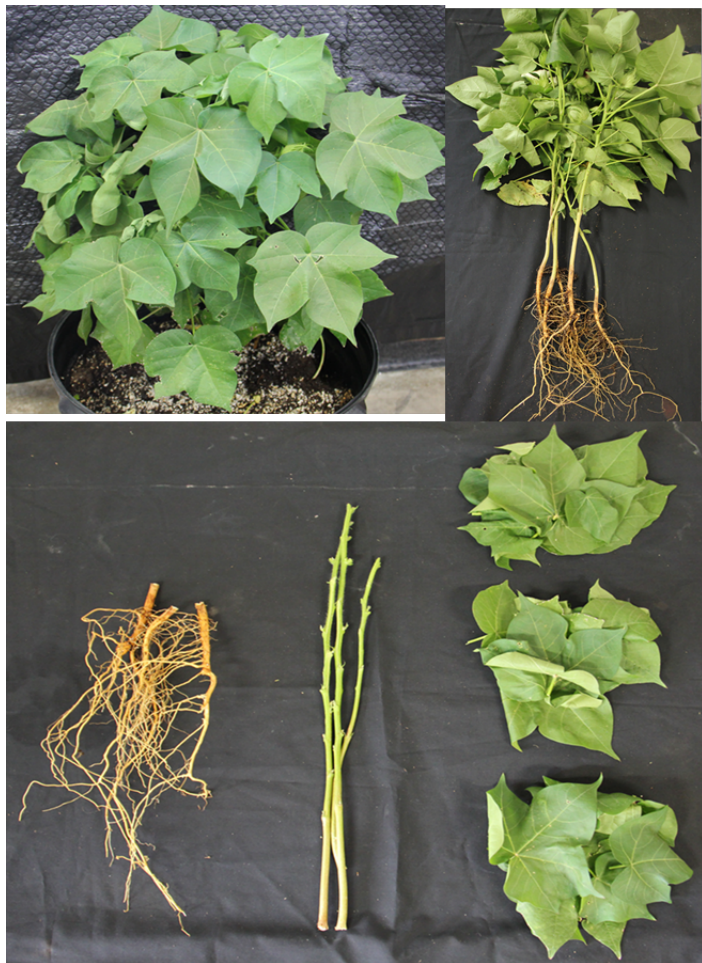
Plant biomass material