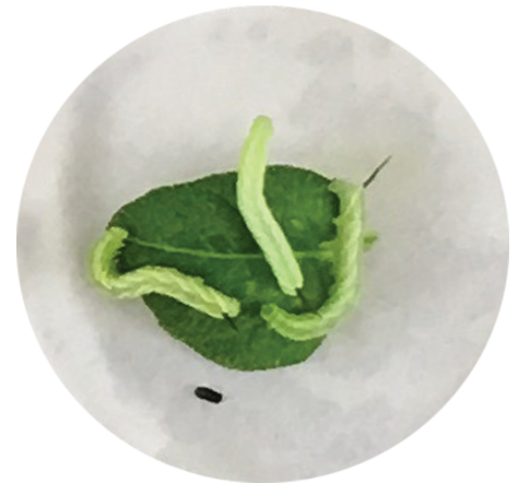
Apply larvae + Start infestation timer