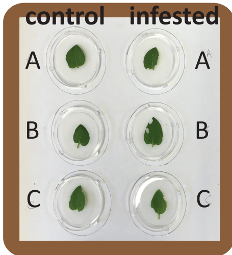
Remove larvae + Start harvest point timer