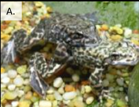
0 = not amplexed/attempting amplexus