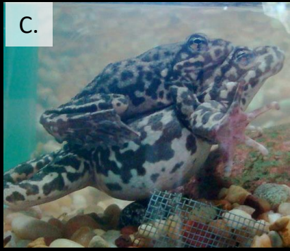
2 = amplexed with male squeezing