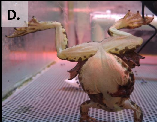
5 = amplexed female w