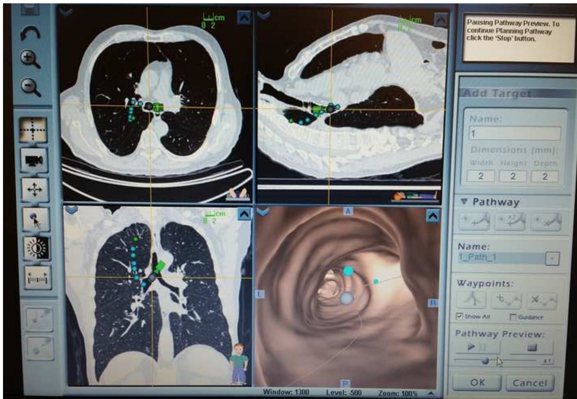
Figure1 Click here to download high resolution image