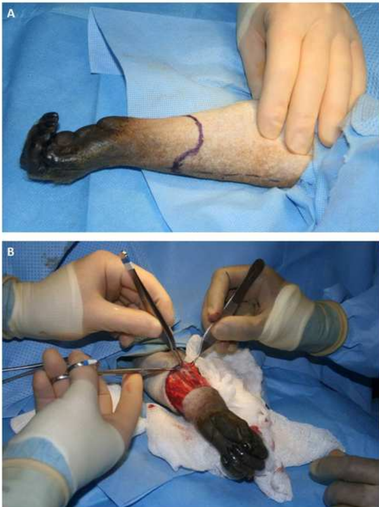
Figure Click here to download high resolution image