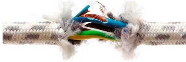
Wires in bad condition