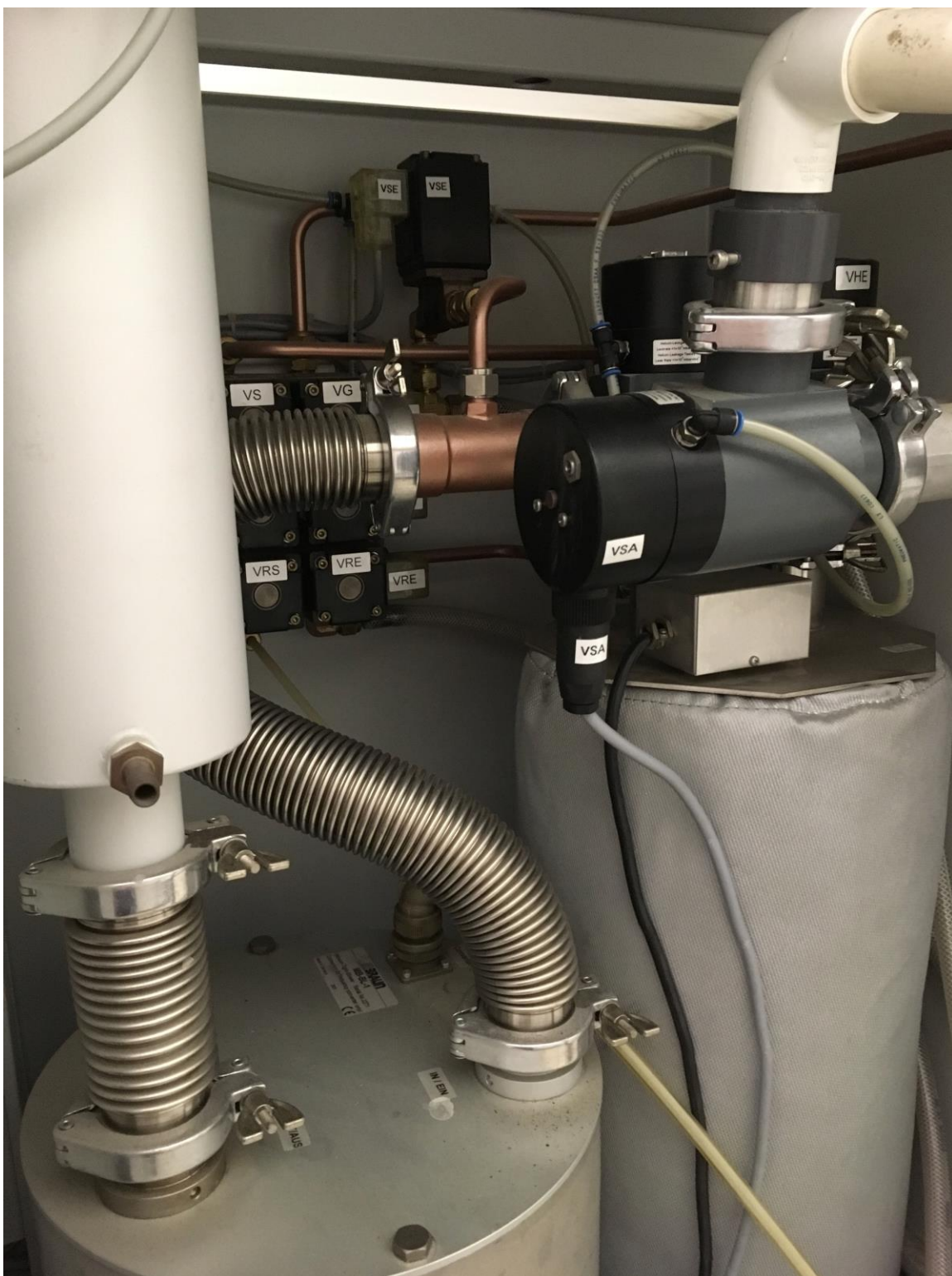
Figure 3. The catalyst container is connected to the main chamber by two valves, which allows the atmosphere to circulate through the catalyst bed.