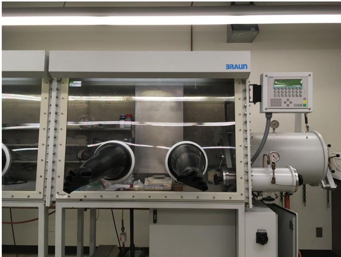
Figure 1. The glovebox, showing the main chamber, the gloves, the control panel, and the large/small antechambers.