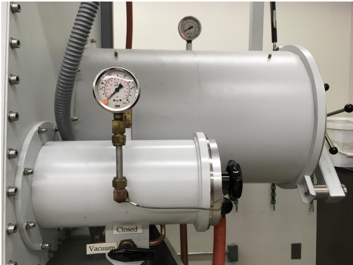
Figure 4. The large and small antechambers each have their own pressure gauge and valve.