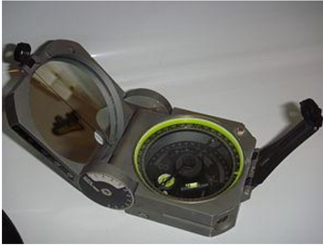
FIG 1: The Brunton Compass

Earth Science/Geology Science Education Title: Use of the Brunton Compass to Determine Spatial Orientation of Rock Layers