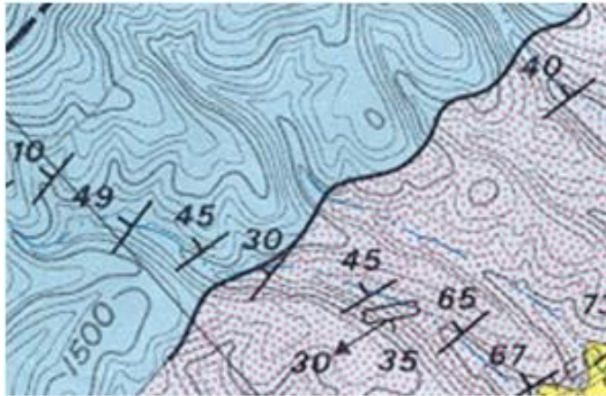
Fig 3: Strike and Dip of Bedding on a Map

Strike and dip of bedding, the most common kind of rock orientation data, is shown at a specific location with symbols like the ones in the map.